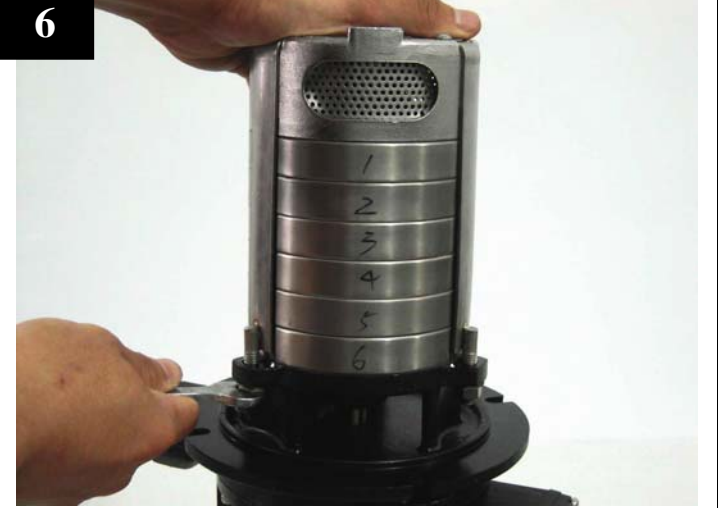
Loose the nuts on straps. Remove the 3 straps.