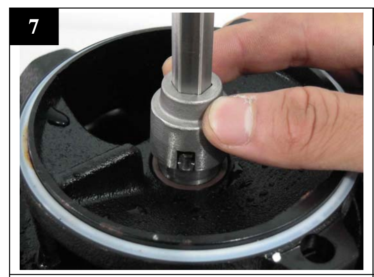
Place the cap onto rotary parts.