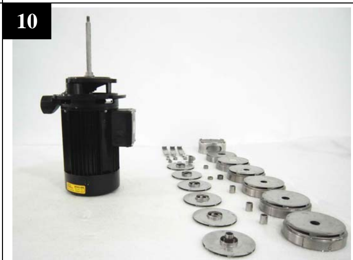
place all impellers, sleeves and intermediate chambers in order.