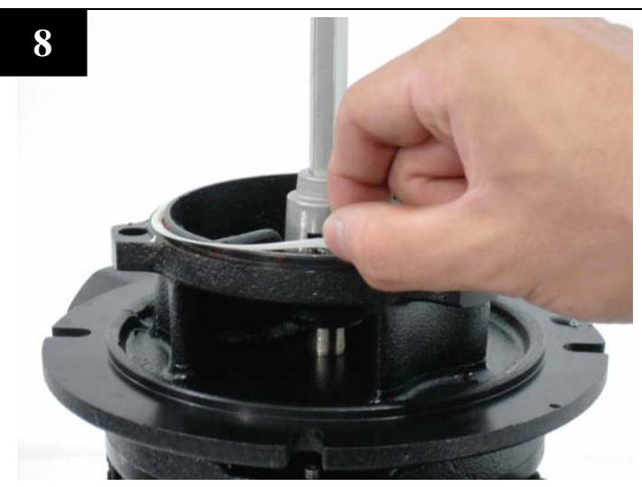
Place a new gasket on pump casing.