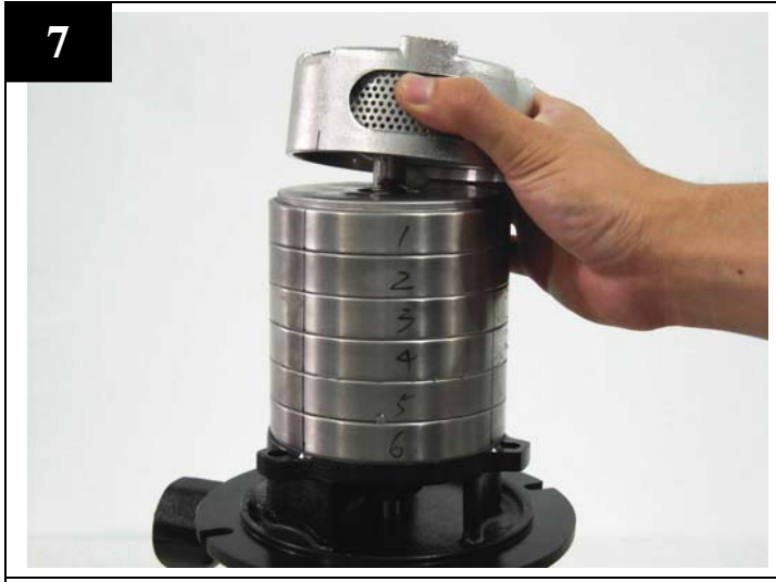
Remove the suction intercon-nector.