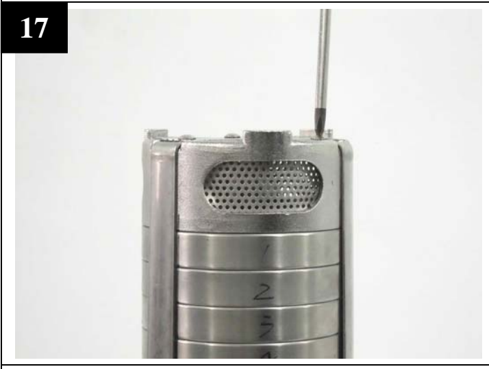
Install the filter.