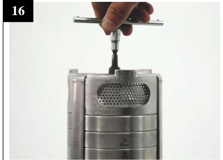
Rotate the shaft and make sure no rubbing noise inside. Otherwise, loose the screws and repeat the above process until the rotation is smooth.