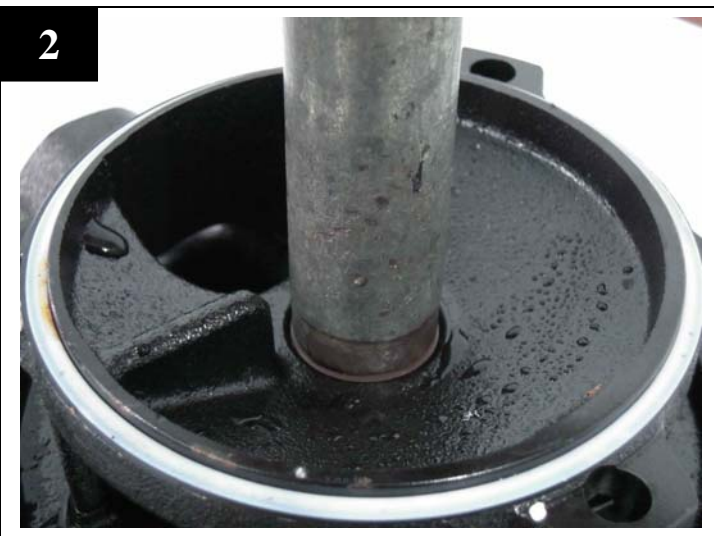
Place the stationary part in position and press in.