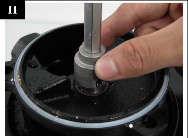
Remove the cap.