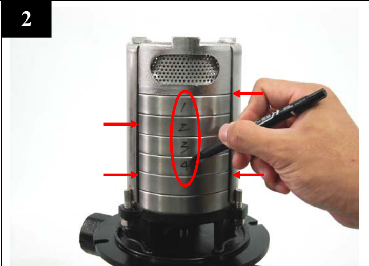
Mark the number of the intermediate chambers and draw a line along with straps.