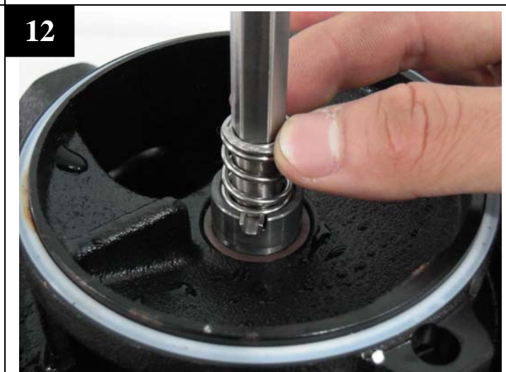
Remove the spring.