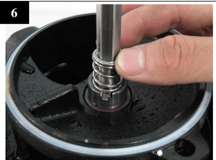
Place the spring onto rotary parts.