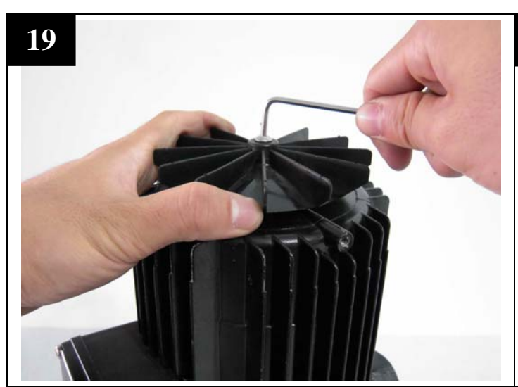
Install the motor fan. Xrorque 10 kgf ⋅ cm