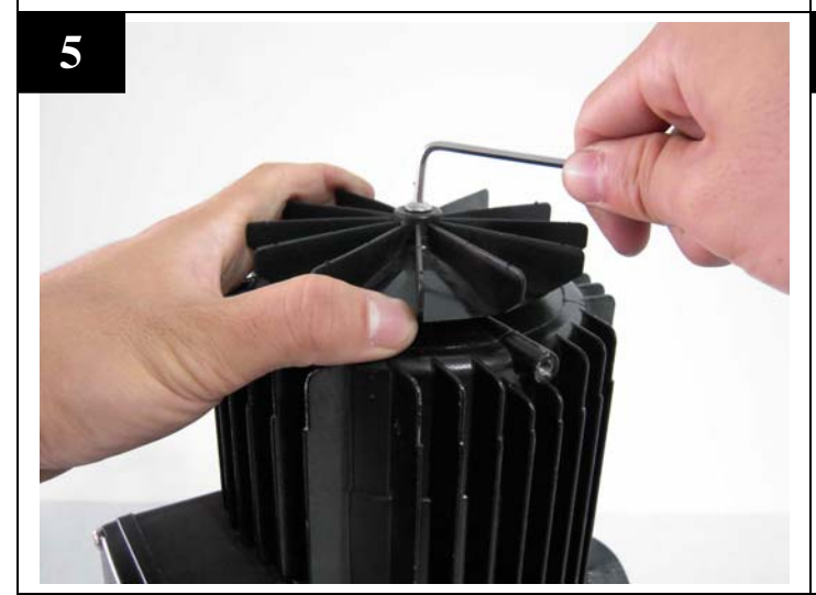
Using Allen wrench to remove the motor fan.