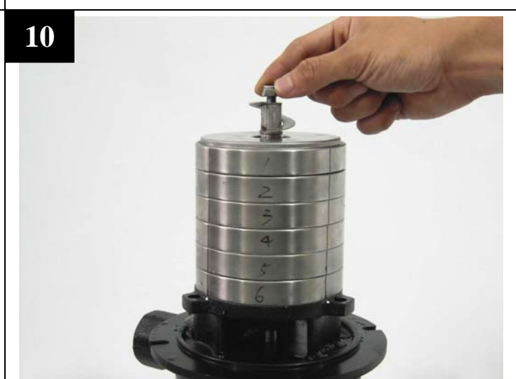
Place the lock nut.