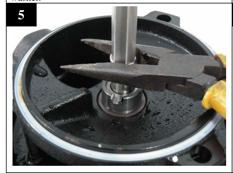
Place the retainer.