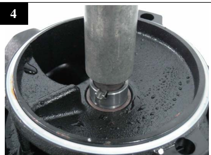
Remove the cap and press in rotary parts.