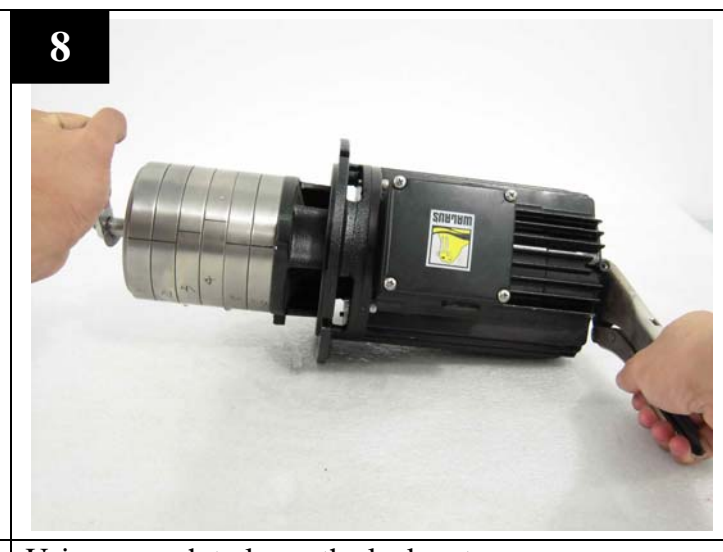
Using wrench to loose the lock nut.