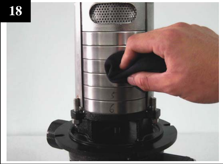
Remove all marks.