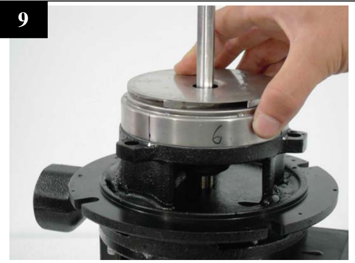
Place back all impellers, sleeves and intermediate chambers in order.