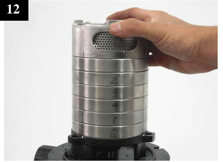
Place the suction intercon-nector.