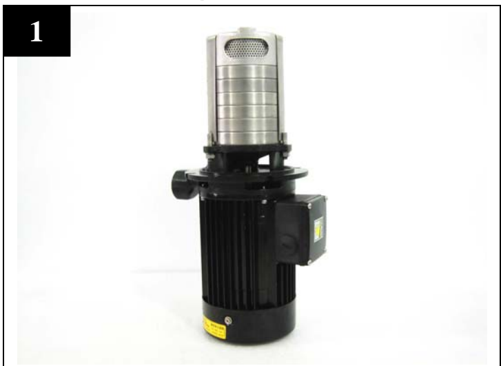
Place the pump on work bench with motor down.