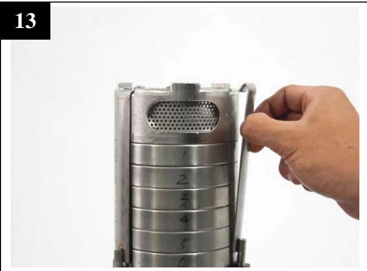
Install the 3 straps.