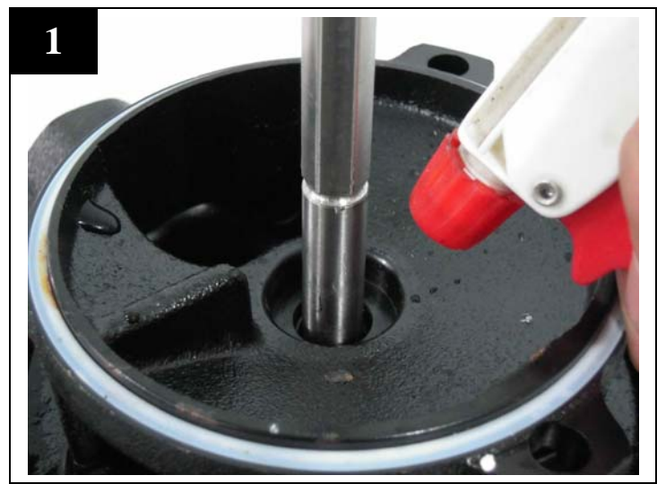
Spray water on the shaft as lubrication.