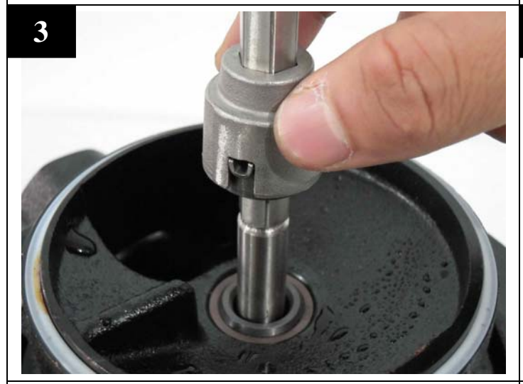
Before press in rotary parts, insert the sleeve through the hex shaft aligning the slots on sleeve to tabs on washer.