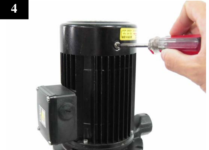
Loose the screws and remove the motor fan cover.