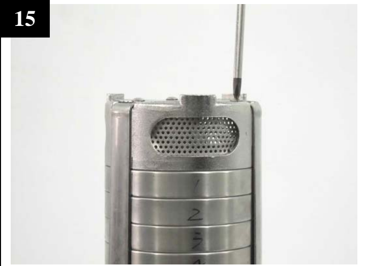
Remove the filter.