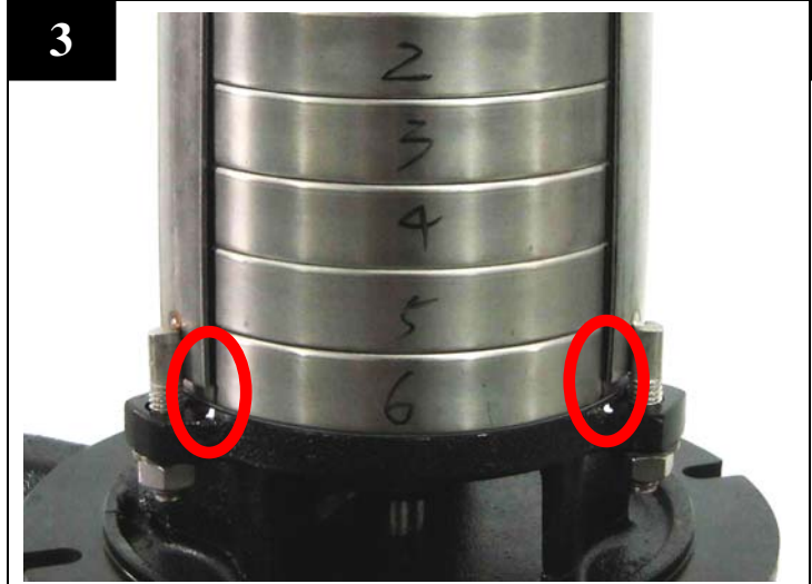
Draw the line all the way down to pump casing.