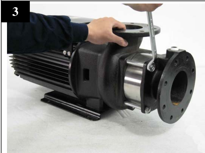
Using Allen wrench (metric size) to loose the stud bolts and remove pump cap.