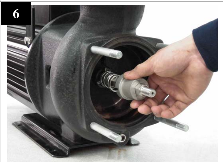
Remove the cap.