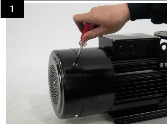
Loose the screws and remove the motor fan cover.