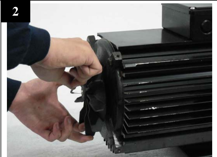
Using Allen wrench to remove the motor fan.