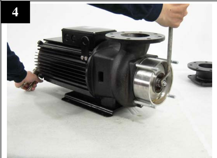
Using wrench to loose the lock nut.