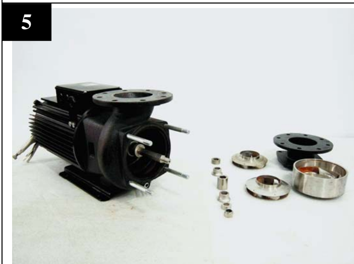
Remove all impellers, sleeves and inter-mediate chambers and place them in order.